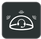
Acoustic Shield Technology

The Yealink WH62 is a new entry-level DECT wireless headset, with WH62 Dual and WH62 Mono two models. Work seamlessly with major UC platforms and integrate natively with Yealink IP phones. For crystal sound experience, Yealink Super Wideband Technology and Acoustic Shield Technology make you talk and hear clearly during phone calls and video conferencing. With easily on-ear control, interruption free, comfortable wearing, WH62 is a nice partner either for communicating or collaborating.