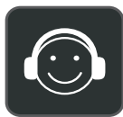
All Day Wearing Comfort