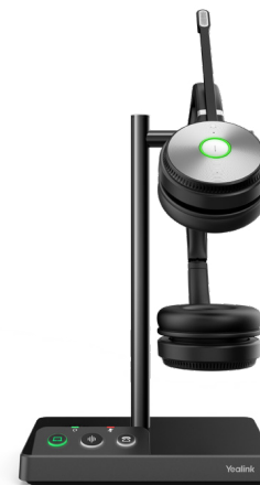
WH62 Dual Teams WH62 Dual UC