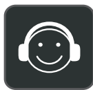
All Day Wearing Comfort