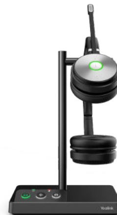
WH62 Dual Teams WH62 Dual UC