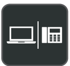
Multiple Devices Connection