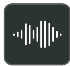
Optima Audio Experience