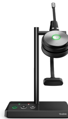
WH62 Mono Teams WH62 Mono UC