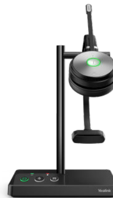
WH62 Mono Teams WH62 Mono UC