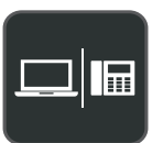
Multiple Devices Connection