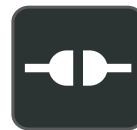
Plug and Play