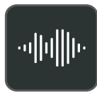
Optima Audio Experience