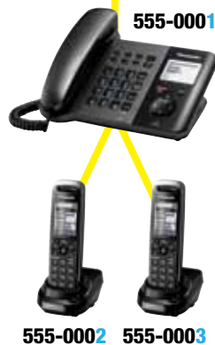
3 Users: 3 DID