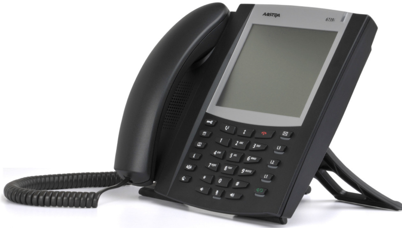
6739i Aastra IP Phone at 60° incline angle front view