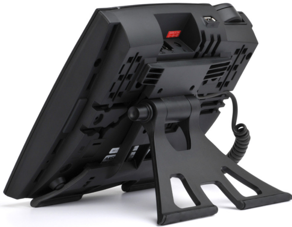
6739i Aastra IP Phone at 60° incline angle back view