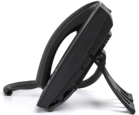
6739i Aastra IP Phone at 60° incline angle side view