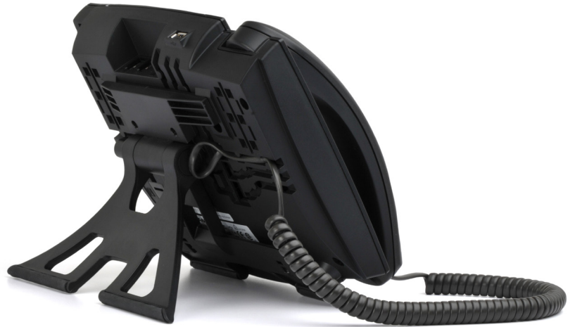
6739i Aastra IP Phone at 60° incline angle back view